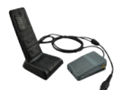
Desktop Mic & Pedal PTT