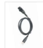
Programming Cable (USB Port)