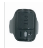
Wireless Finger PTT